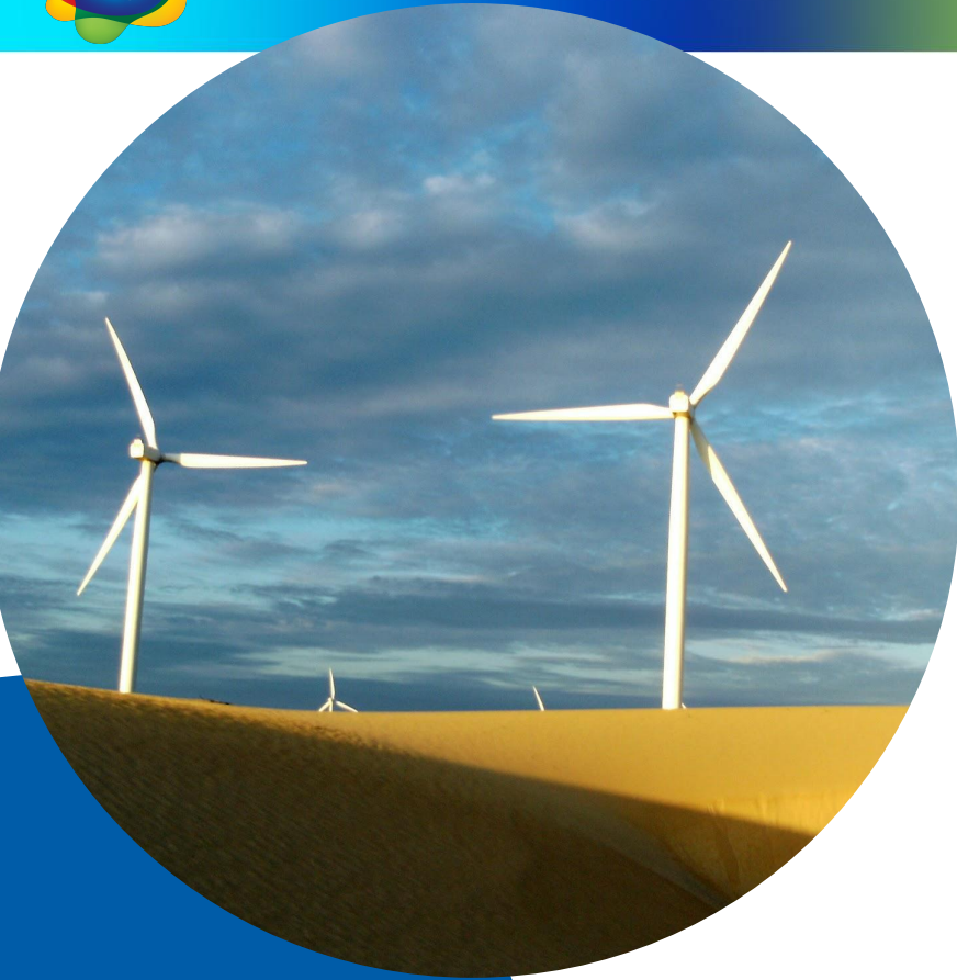
Wind turbines Rio Grande do Norte